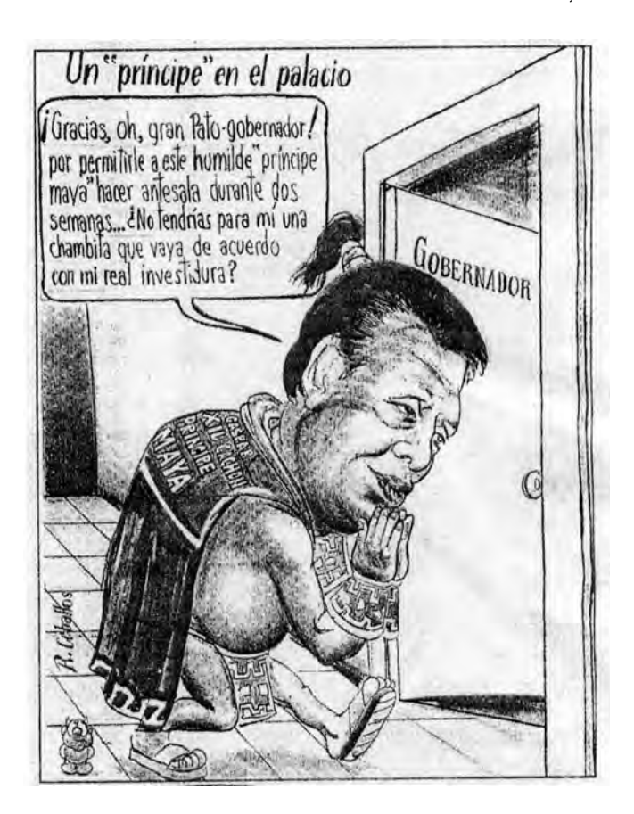
Figure 2 'A Prince in the Palace'

'Thank you oh great Duck-Governor! [nickname for Gov. Patricio Patrón Laviada] for allowing this humble "Maya prince" who has been waiting for two weeks . . . Don't you have a little something for me that will fit my royal standing?'